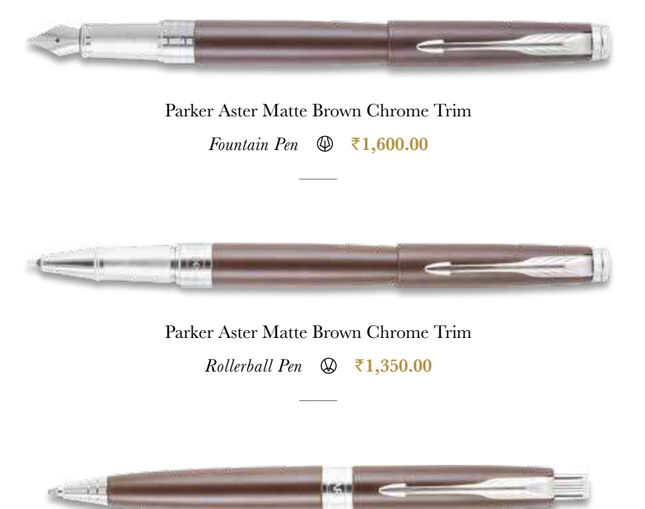
Parker Aster Matte Brown Chrome Trim Ballpoint Pen ② ₹1,150.00