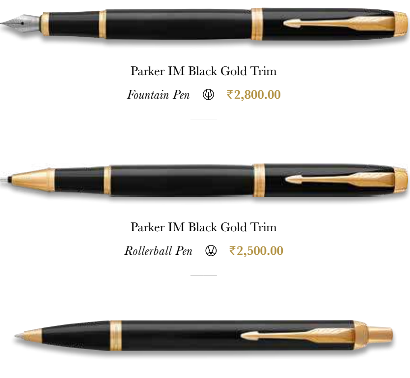
Parker IM Black Gold Trim Ballpoint Pen ⊗ ₹2,300.00