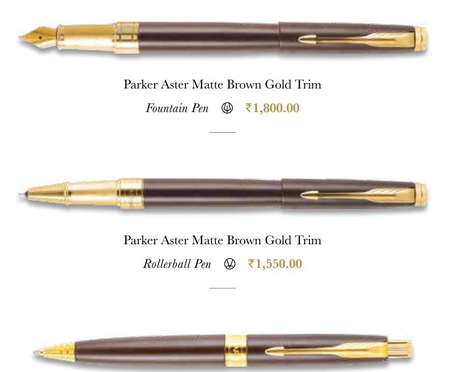
Parker Aster Matte Brown Gold Trim Ballpoint Pen இ ₹1,350.00